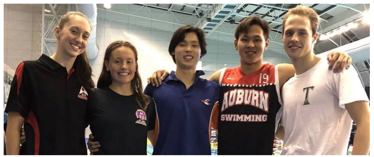
The Australian Junior World Championship Team was announced at the completion of the finals. Huge Congratulations to 5 NSW Swimmers who made the team and their coaches.