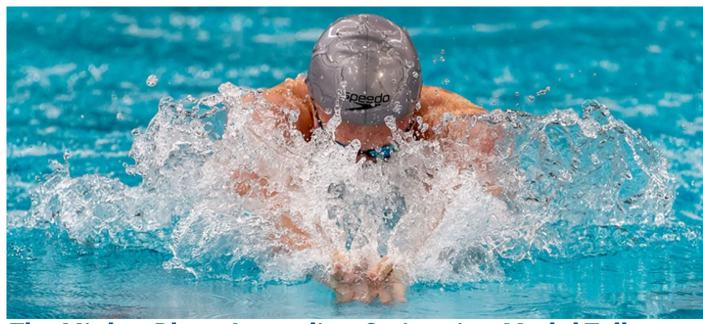
The Mighty Blues Australian Swimming Medal Tally