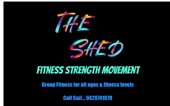
The Shed Gym - Locally run gym owned and operated by Suzi Ellis.