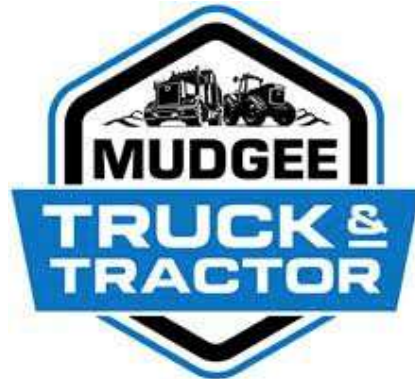
Call in to see Mark @ Mudgee Truck and Tractor for all your spare parts and machinery needs.