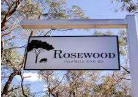
Rosewood Cottage Mudgee AIRBNB Accommodation

Thanks to the following local businesses for their support and generosity in assisting to host this event: