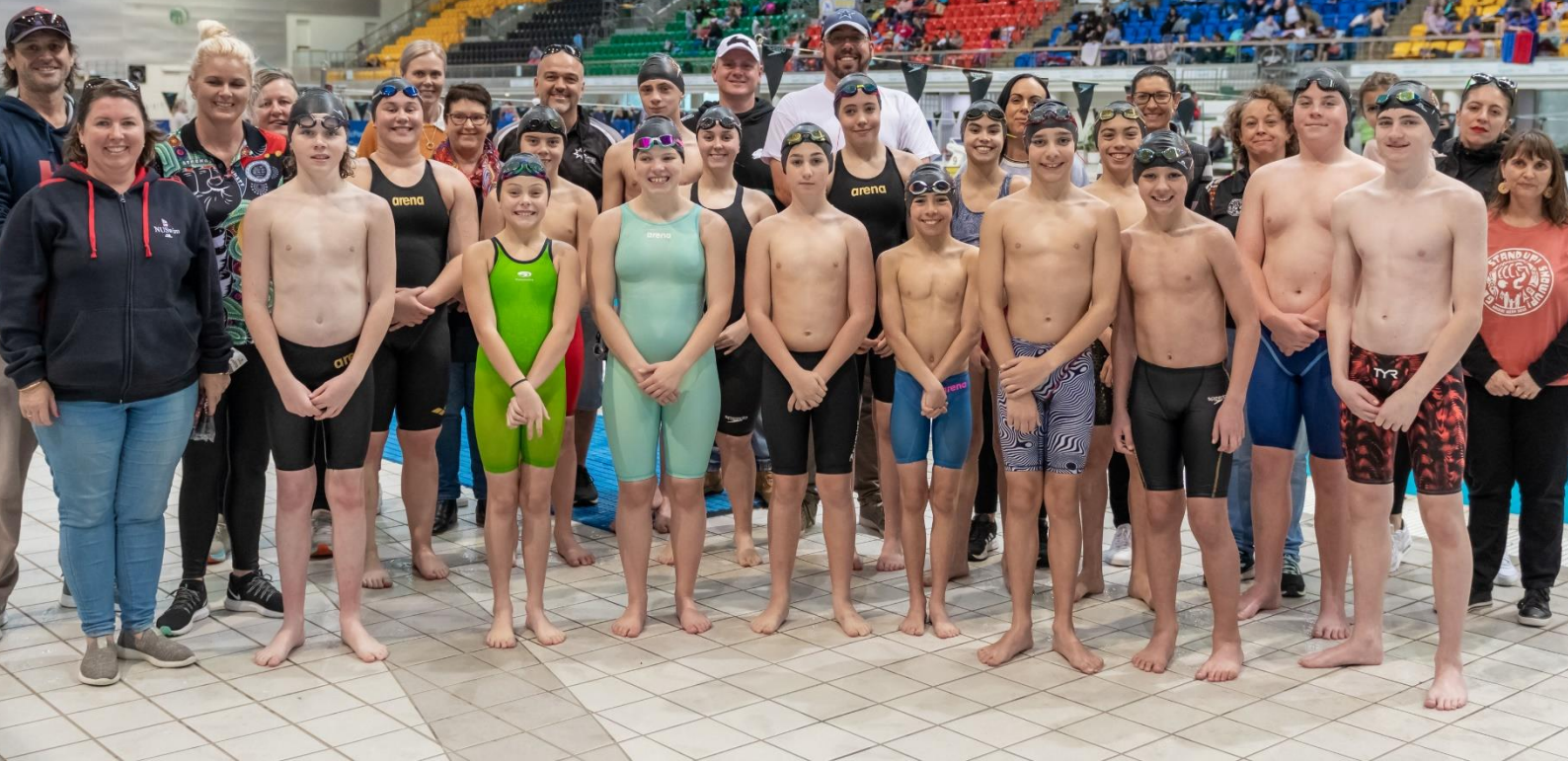
2022 NAIDOC Relay Participants