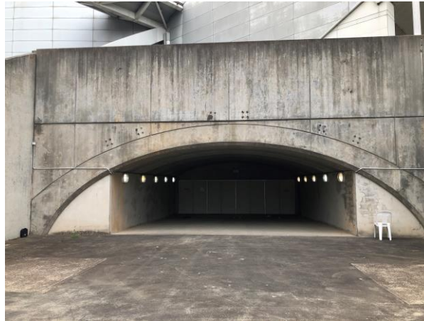
ALL EVENT ATTENDEES ENTRANCE