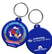
2022 NT Swimming Country Championship Key Ring $8.00