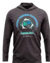
2022 NT Swimming Country Championship 'Names' Hoodie - Navy Marl $50.00