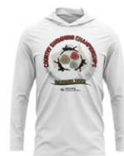
2022 NT Swimming Country Championship 'Names' Hoodie - White Marl $50.00