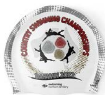
2022 NT Swimming Country Championship Seamless Cap - White $15.00