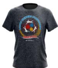
2022 NT Swimming Country Championship 'Names' Tee - Charcoal $35.00