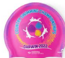
2022 NT Swimming Country Championship Seamless Cap - Pink $15.00