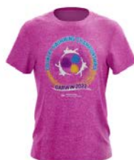
2022 NT Swimming Country Championship 'Names' Tee - Pink $35.00